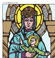
Blessed are You Among Women